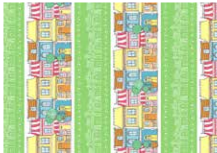
7313-YG 1½ yds