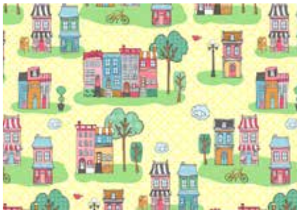
7311-Y 1 yd