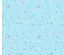
7315-YB ½ yd