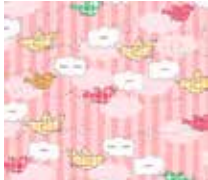
7312-YE ¼ yds